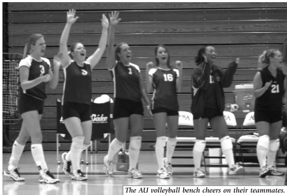
The AU volleyball bench cheers on their teammates.

Watkins noted, "We have picked up players from the traditionally strong club programs, as well as some standout athletes from state finalist high schools. I think this combination makes us a more complete and dangerous team. The most important thing will be for our leaders to step up and to develop a group of good players into a team that is focused on team success."